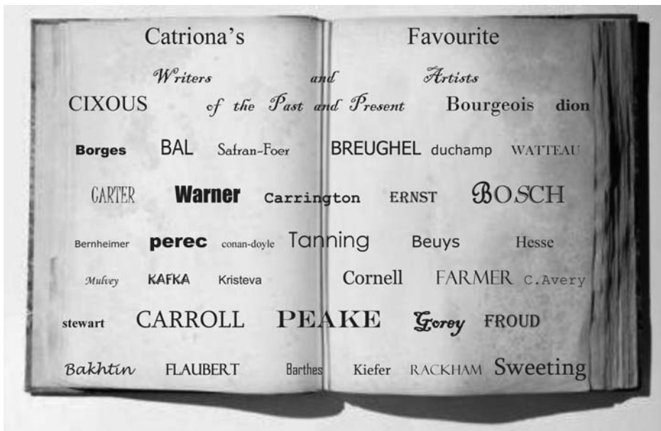
Based on 'Max Ernst's Favorite Poets and Painters of the Past' in View Magazine: Special Max Ernst Edition , Charles Henri Ford ed. Series II, No.1 (April 1942): 14-15.